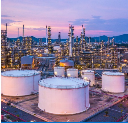
Oil & Gas